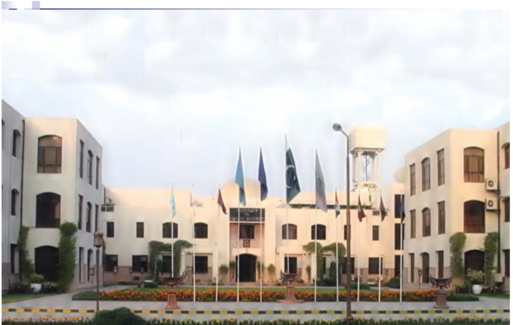
UNIVERISTY OF HEALTH SCIENCES, LAHORE